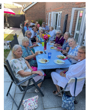
Enjoying eating lunch together