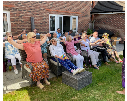
Exercise class at Holiday at home