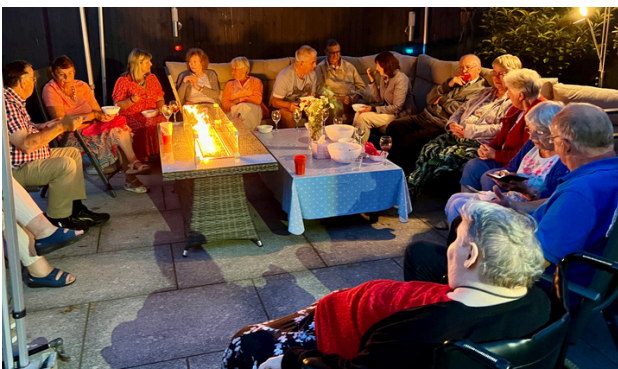
Eating together, meeting and making new friendships

Company was launched in August in response to a number of people who have attended our bereavement support groups saying how hard they find it to go out socially to eat.