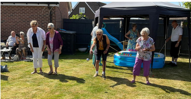
Our young 90+ year olds playing boules

Due to the success of Holiday at Home and from the incredibly positive feedback we have received, we plan to run Holiday at Home again next year so watch this space, book your place and volunteers be ready.